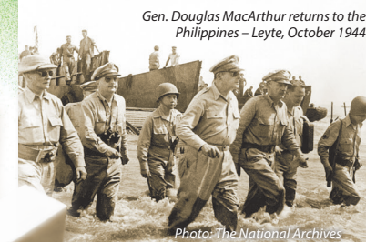
Gen. Douglas MacArthur returns to the Philippines – Leyte, October 1944

Eleven burial plots are arranged in concentric rings around the memorial and mall. The majority of the white marble headstones were quarried and fabricated in Italy and a small quantity from Romblon, Philippines.