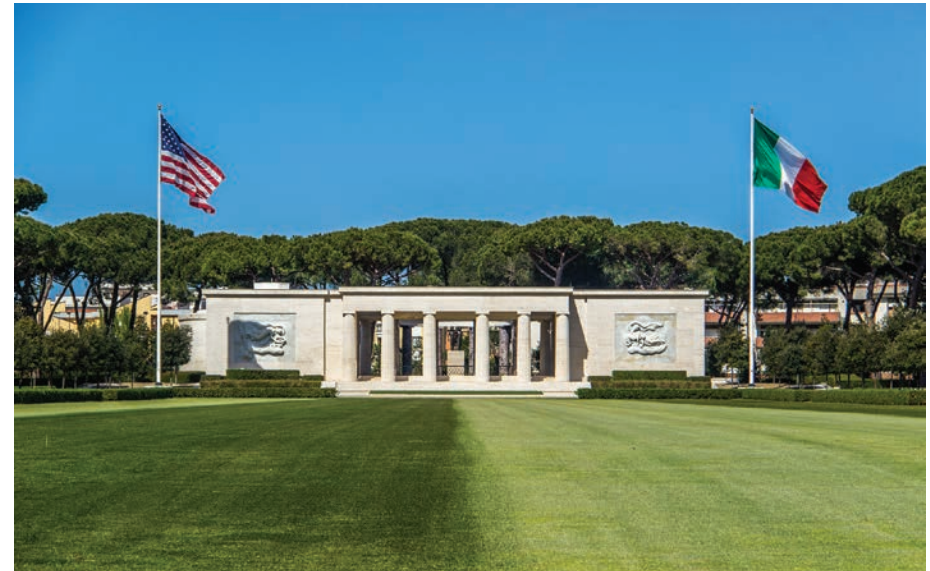
The memorial viewed from the east.