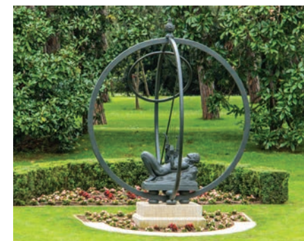
A statue of Orpheus rests on the armillary sphere in the South Garden.

On the east wall is one large map, “The Landing at Anzio/Nettuno and the Capture of Rome.” This map portrays the landings in the vicinity of Anzio, the establishment of the Anzio beachhead, the subsequent fighting therein, the final breach of the Gustav Line on May 11, 1944 by American and Allied forces, the swift Allied advance north, the link up with troops breaking out of the Anzio beachhead, and the liberation of Rome on June 4, 1944.