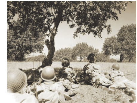
82nd Airborne Division paratroopers at Biazza Ridge, Sicily, the second day after their night jump on July 9, 1943.

The American Seventh Army moved to capture the city of Palermo, the capital of Sicily. The British under Gen. Bernard Montgomery were to advance and capture Messina in the northeastern corner to cut off the Germans from crossing to the Italian mainland. The Germans and Italians made skillful use of rough terrain augmented by minefields, but American