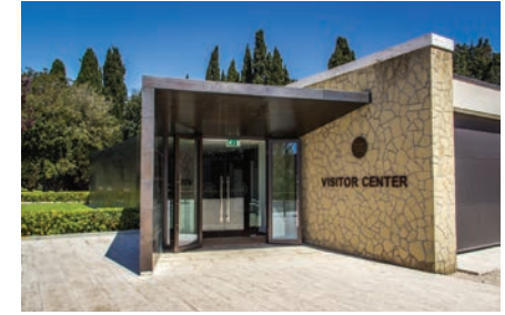
Entrance to the visitor center.

Dedicated in 2014, the 2,500 square-foot visitor center is adjacent to the visitor reception and family room located just to the right (North) of the cemetery entrance. The visitor center provides visitors the opportunity to meet members of the cemetery staff. They are happy to answer visitors’ questions and to provide information about the cemetery.