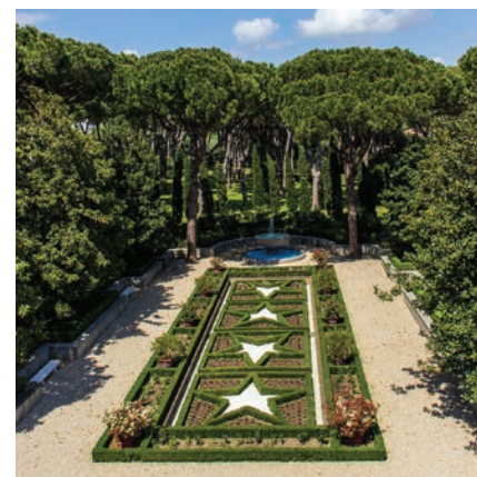
The North Garden.

At the far end of the garden is a Baveno granite fountain consisting of a large-semi-circular bowl on a wide pedestal. It was carved from a single piece of granite quarried near the north end of Lake Maggiore. Cascades of water flow from the bowl into a low basin.