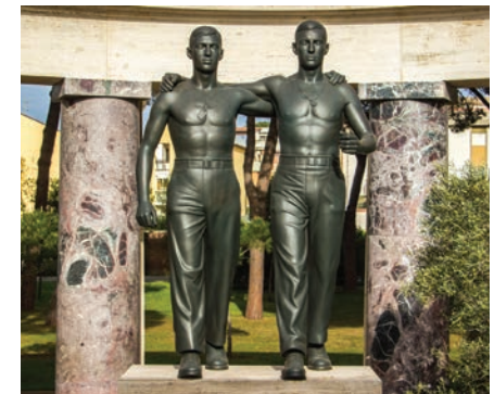
The “Brothers in Arms” sculpture is the central feature of the peristyle.

“The “Brothers In Arms” sculpture represents an American soldier arm in arm with an American sailor. The statue symbolizes the fraternity between the U.S. Army and Navy that was essential to the success of the three amphibious assaults in Italy during World War II. The two servicemembers can be distinguished via small differences in their identification tags, belt buckles, and trouser pockets. The bronze sculpture is by Paul Manship of New York. It was cast at the Battaglia Foundry in Milan.