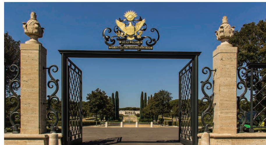
The U.S. seal surmounts the cemetery's entry gates. Immediately inside to the right are the visitor building and the visitor center.

THEY DIED THERE VALIANTLY AND HEROICALLY, GIVING THEIR LIVES THAT PEOPLES OF EUROPE MIGHT BE LIBERATED FROM TYRANNY. ... THEY REST TRANQUIL AND SECURE IN THE FRIENDLY SOIL OF ITALY. MAY OUR GREAT DEBT TO THEM, AND ALL OTHERS WHO DIED IN THE CAUSE OF FREEDOM, SERVE AS AN INSPIRATION TO ALL PEOPLES TO DEDICATE THEMSELVES TO FREEDOM AND LASTING PEACE.