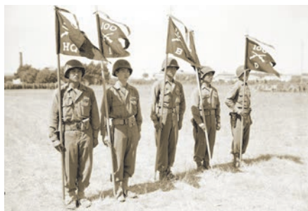
Guidon bearers of the 100th Battalion, 442nd Regimental Combat Team. The Japanese American unit was among those reaching the Arno River area on July 23, 1944.

The Allies broke through the Gustav Line on May 13. They pushed on to link up with the Anzio beachhead and overrun subsequent German defensive lines. On June 4, 1944 American units entered Rome and liberated the first European capital city of the war.