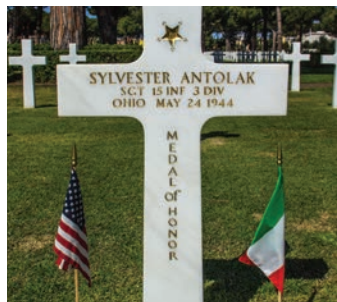
Sylvester Antolak’s headstone.