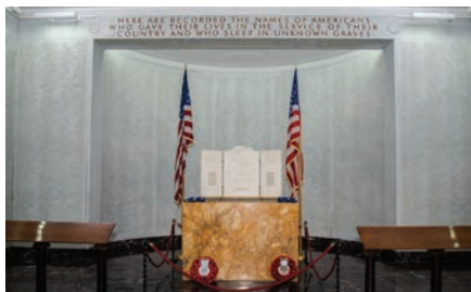
The altar, flanked by Tablets of the Missing.

On the altar of golden Broccatello Siena marble is a triptych of Serravezzo white marble from the Carrara region designed by Paul Manship. Carved in relief on the side panels of the triptych are angels holding palm branches. The left panel bears a quotation from Psalm 8:3-5 with reference to the sculptured ceiling dome.