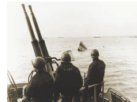
Sailors at a 40 mm anti-aircraft gun mount aboard USS Brooklyn (CL-40) observe USS Portent (AM-106) sinking off Anzio after hitting a mine on D-Day, January 22, 1944.

As the Anzio struggle was being fought, the Allies mounted major attacks on Cassino and Monte Cassino in February and March. The Germans repulsed the attacks, with heavy casualties to the Allies forces.