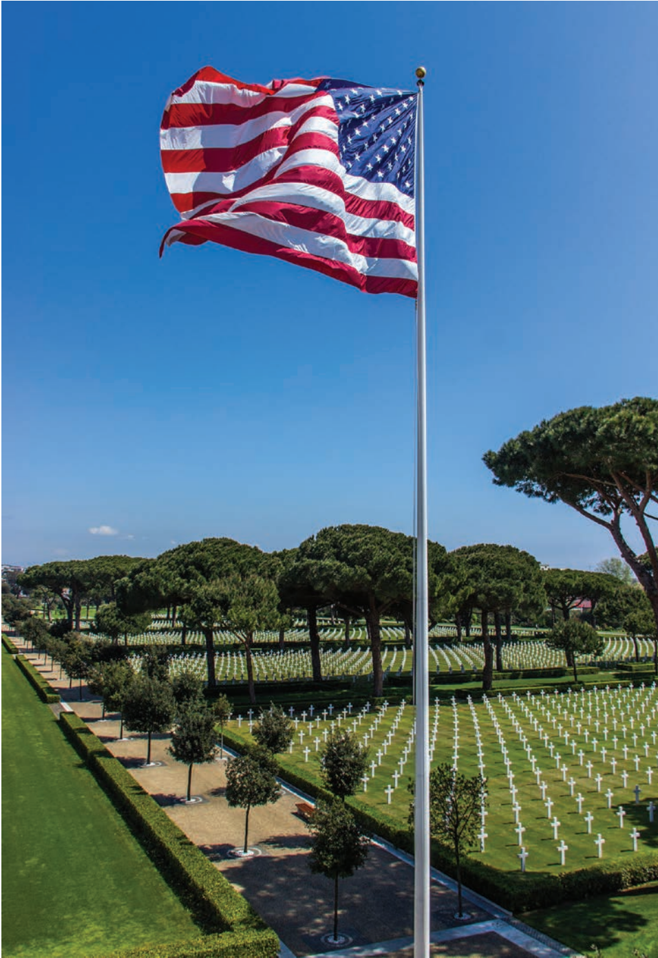
The graves area is seen looking eastward from the Memorial.