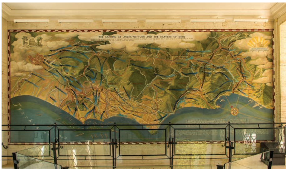
The map on the east wall is named “The Landing at Anzio/Nettuno and the Capture of Rome.”

On the west wall are three maps – “The Capture of Sicily,” “The Strategic Air Assaults” and “The Naples-Foggia Campaign.” To aid in understanding them, the maps bear explanatory inscriptions. Beneath the maps are two sets of key maps, “The War Against Germany” and “The War Against Japan.”