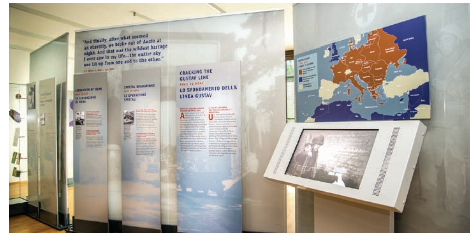
Interactive touchscreen kiosk stations enable visitors to explore the details of the several campaigns represented here.

Restrooms are conveniently located in the visitor center.