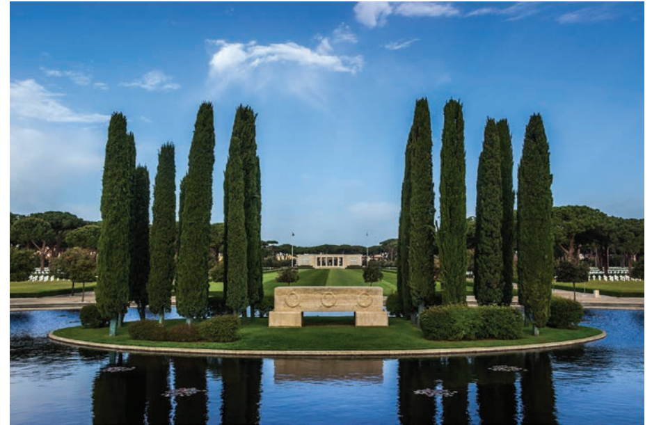
The reflecting pool with cenotaph.

The cemetery sits in the zone of advance of the U.S. 3rd Infantry Division during the Anzio-Nettuno campaign beginning in January 1944. A temporary wartime cemetery was established here on January 24, 1944, two days after the units of the VI Corps landed on the beaches nearby.