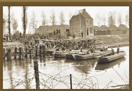
Soldiers of the 316th Engineers build a pontoon bridge over the Scheldt River. Audenarde, November 1918.