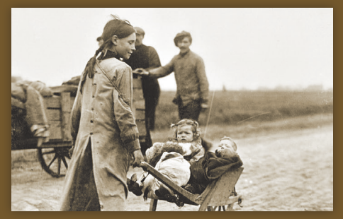
Belgian refugees walking toward Waregem, returning to areas liberated by American units. November 2, 1918.