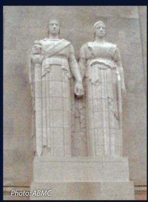
Two heroic-size figures on the west side depict the unity of the United States and France.

The 3d Division held the south bank of the Marne until the French-American counteroffensive forced German withdrawal. It earned the nickname "Rock of the Marne."