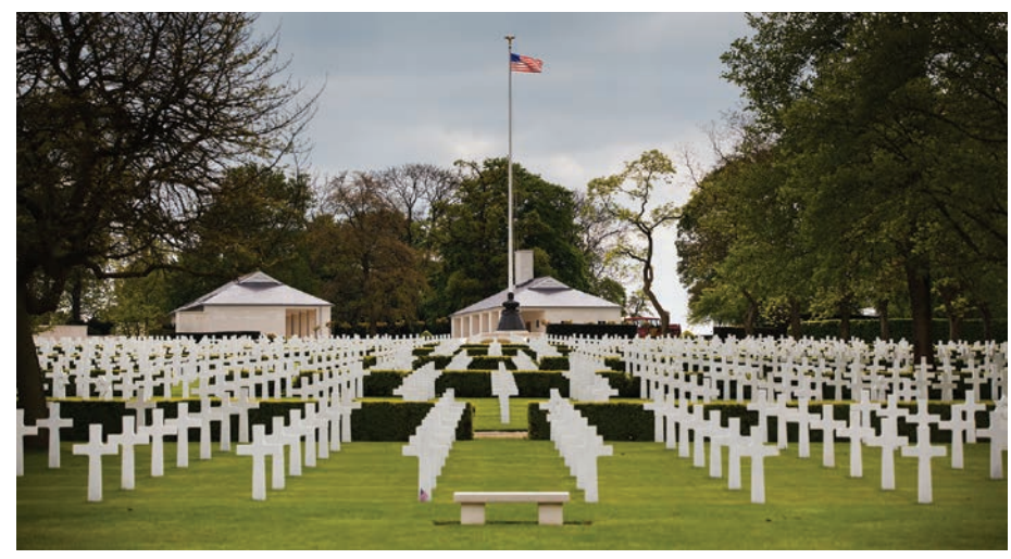
In the Cambridge American Cemetery the headstones are aligned like the spokes of a wheel.

I SHALL MAKE IT CLEAR AT THIS MOMENT THAT WE NEVER FAILED TO RECOGNIZE THE IMMENSE SUPERIORITY OF THE POWER USED BY THE UNITED STATES IN THE RESCUE OF FRANCE AND THE DEFEAT OF GERMANY.