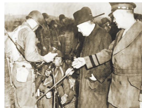
Prime Minister Winston Churchill and General Dwight D. Eisenhower inspect a mortar crew during a tour of an American Army base in England before D-Day, 1944.

American forces that had been building in England since mid-to-late 1942 were committed into Operation TORCH. American task forces landed on beaches flanking Casablanca, Morocco. Combined Anglo-American task forces similarly attacked Oran and Algiers, Algeria. Near Casablanca and Oran, resistance