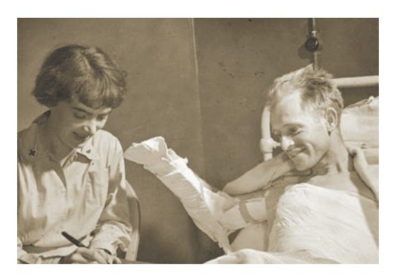
A Red Cross worker in an Army hospital in Great Britain assists a soldier in writing a letter back home.

The American Forces Radio Network broadcast from the United Kingdom,