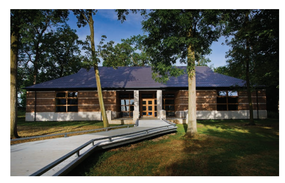
The visitor center is located convenient to the cemetery entrance.