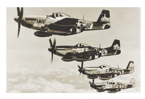
North American P-51 Mustangs of the 361st Fighter Group fly in formation over England in 1944.

Advances in the Mediterranean opened up airfields complementing those in Great Britain, permitting shuttling between theaters and exposing more German territory to strategic bombing.