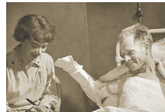
A Red Cross worker in an Army hospital in Great Britain assists a soldier in writing a letter back home.

Cambridge American Cemetery honors more than 8,500 Americans who died in operations based out of the United Kingdom. These include those who battled to secure the Atlantic, those who fought in the skies over Europe, and those who prepared for and participated in the invasion through Normandy and the campaigns that followed.