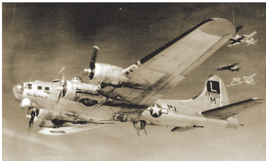
The B-17G Flying Fortress “Mon Tete Rouge II,” and other bombers of the 452nd Bomb Group, flying on a mission to bomb German targets in France on March 28, 1944.