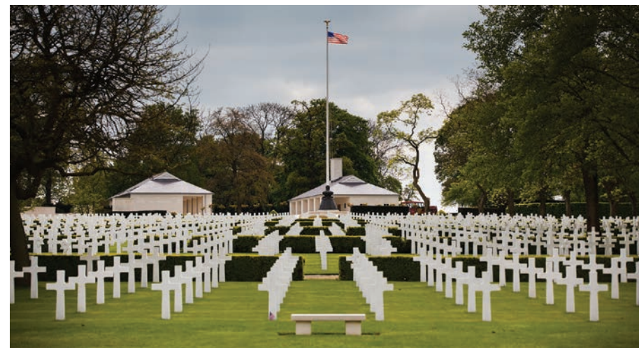
In the Cambridge American Cemetery the headstones are aligned like the spokes of a wheel.

I SHALL MAKE IT CLEAR AT THIS MOMENT THAT WE NEVER FAILED TO RECOGNIZE THE IMMENSE SUPERIORITY OF THE POWER USED BY THE UNITED STATES IN THE RESCUE OF FRANCE AND THE DEFEAT OF GERMANY.