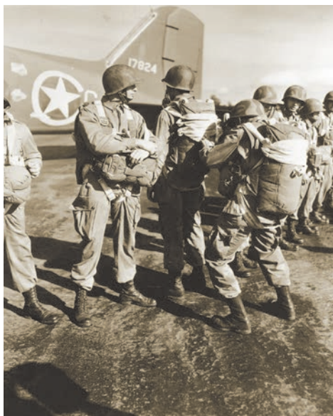
U.S. Army paratroopers of the 2nd Battalion, 503rd Parachute Infantry, inspect equipment before a training jump in England, 1942.

was significant at first, but force and diplomacy induced the Vichy French to surrender. In Algiers, a pro-Allied uprising enabled the landing force to take the city with minimal conflict.