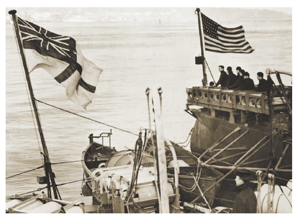
British and American warships lie alongside each other at the U.S. naval base in Londonderry, Ulster. The American warships had escorted a convoy across the Atlantic, and arrived at Londonderry in January 1942.

of shipping more than they replaced with new construction that year. In May 1943 the balance finally tipped decisively in favor of the Allies. In that month, increasingly effective Allied forces sank 41 of 240 German U-Boats, while losing fewer than 300,000 tons of shipping to them.