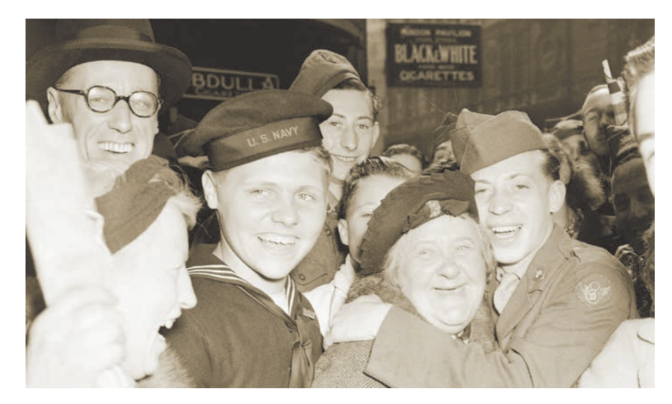
American servicemen and British civilians in London celebrate Germany's surrender. May 8, 1945.

Cambridge American Cemetery honors more than 8,500 Americans who died in operations based out of the United Kingdom. These include those who battled to secure the Atlantic, those who fought in the skies over Europe, and those who prepared for and participated in the invasion through Normandy and the campaigns that followed.