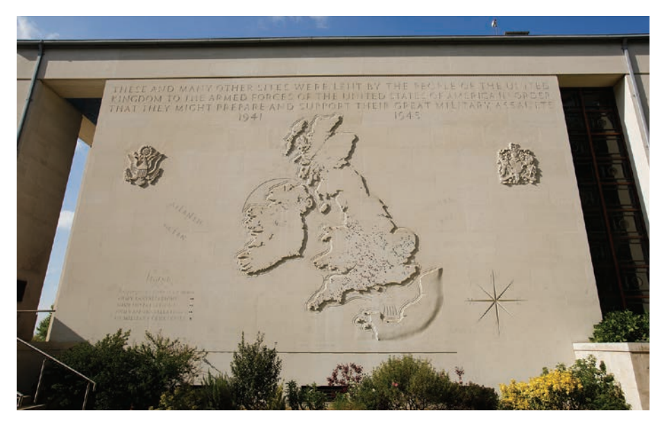
The map displays locations of American units in the United Kingdom during World War II.