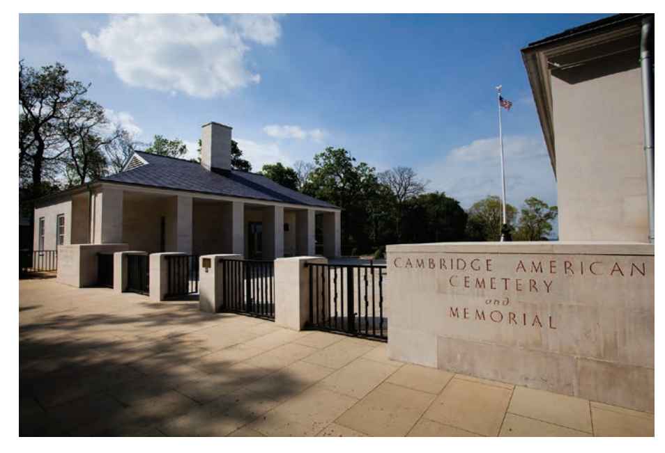
The entrance welcomes visitors to Cambridge American Cemetery.

The cemetery is situated on the north slope of a hill from which Ely Cathedral, 14 miles in the distance, can be seen on a clear day. It is framed by woodland on the west and south. The road to Madingley runs along the cemetery's northern border.