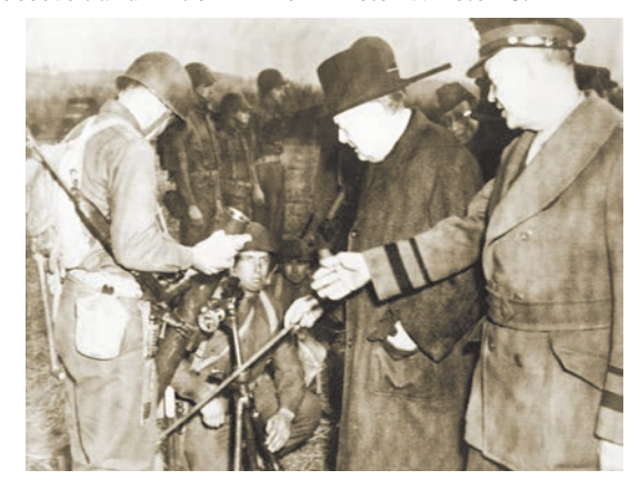
Prime Minister Winston Churchill and General Dwight D. Eisenhower inspect a mortar crew during a tour of an American Army base in England before D-Day, 1944.

American forces that had been building in England since midto-late 1942 were committed into Operation TORCH. American task forces landed on beaches flanking Casablanca, Morocco. Combined Anglo-American task forces similarly attacked Oran and Algiers, Algeria. Near Casablanca and Oran, resistance