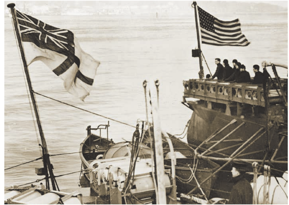
British and American warships lie alongside each other at the U.S. naval base in Londonderry, Ulster. The American warships had escorted a convoy across the Atlantic, and arrived at Londonderry in January 1942.

of shipping more than they replaced with new construction that year. In May 1943 the balance finally tipped decisively in favor of the Allies. In that month, increasingly effective Allied forces sank 41 of 240 German U-Boats, while losing fewer than 300,000 tons of shipping to them.