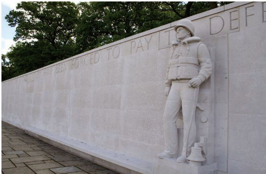
The statue of a Coast Guardsman is one of four standing watch over the Wall of the Missing.

Four statues - a soldier, airman, sailor, and Coast Guardsman - stand guard over the Wall of the Missing.