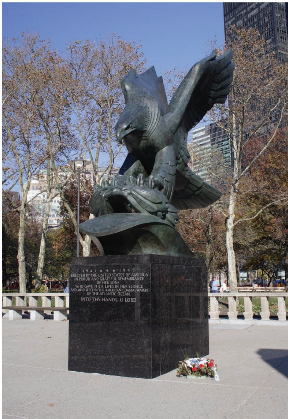
The eagle atop the base points southwest to the Statue of Liberty.

The East Coast Memorial is located in Battery Park in New York City at the southern end of Manhattan Island. It is about 150 yards from the South Ferry subway station on the IRT Lines and stands just south of historic Fort Clinton, on a site furnished by the Department of Parks of the City of New York.