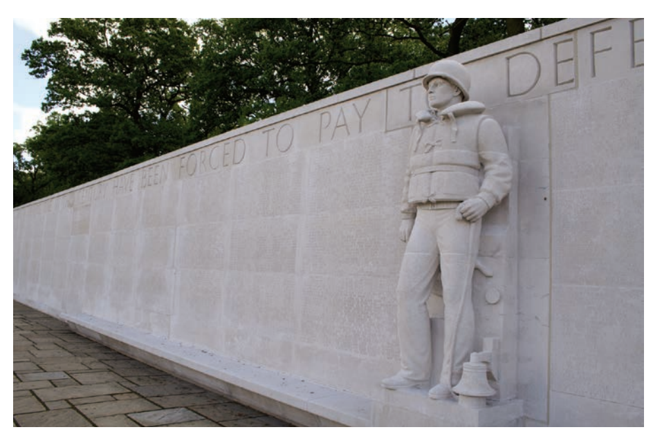
The statue of a Coast Guardsman is one of four standing watch over the Wall of the Missing.