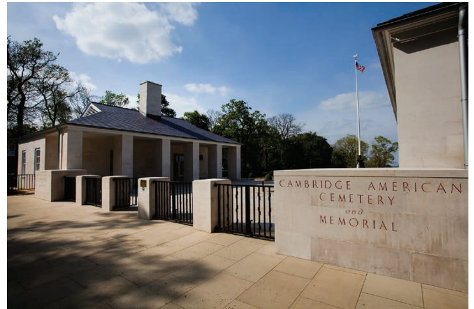
The entrance welcomes visitors to Cambridge American Cemetery.

The cemetery is situated on the north slope of a hill from which Ely Cathedral, 14 miles in the distance, can be seen on a clear day. It is framed by woodland on the west and south. The road to Madingley runs along the cemetery's northern border.