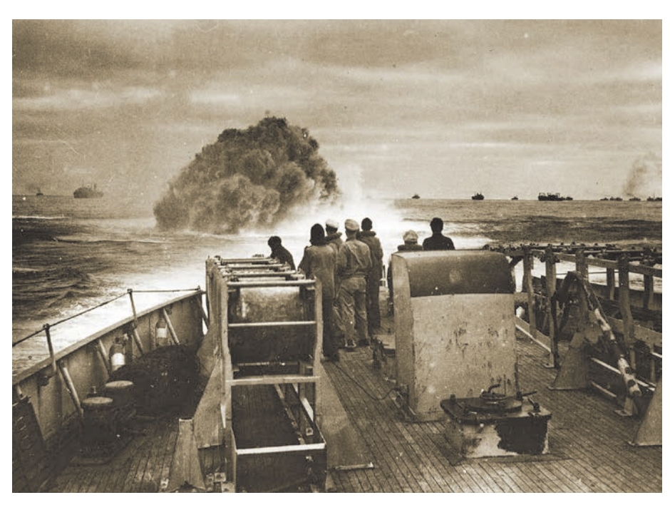
Coast Guardsmen of the U.S. Coast Guard Cutter Spencer watch the explosion of a depth charge blasting German submarine U 175 about to attack a convoy in the North Atlantic. April 17, 1943.

Through 1942 the balance poised precariously, with the Allies losing 800,000 tons