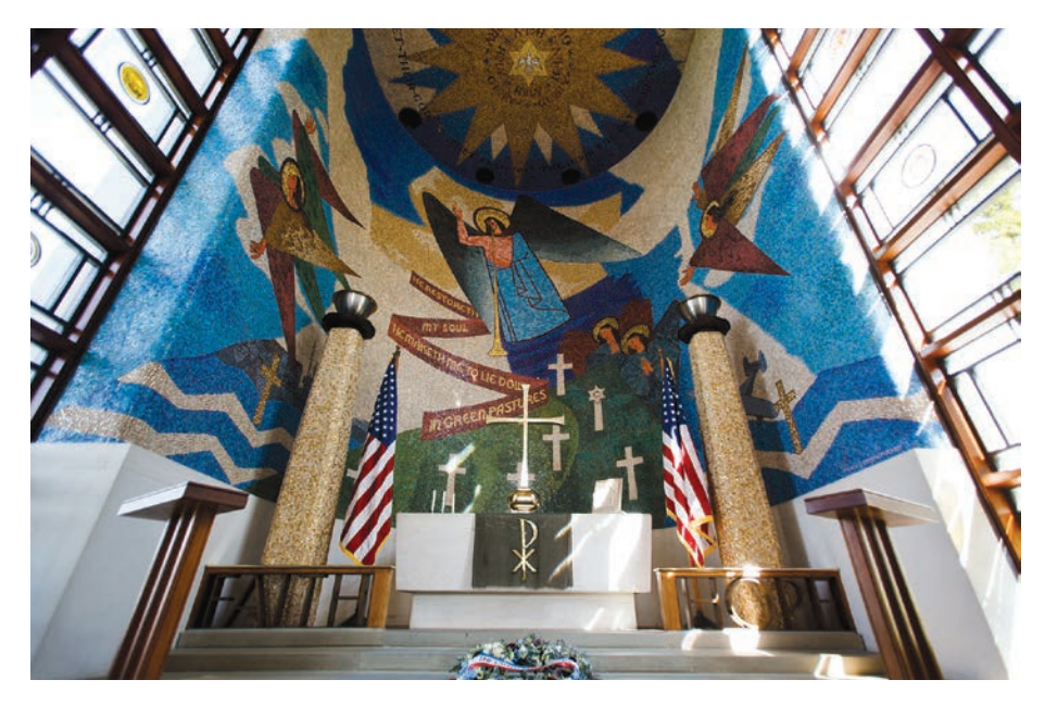
The deep blue of the ceiling above the altar denotes the depth of infinity.