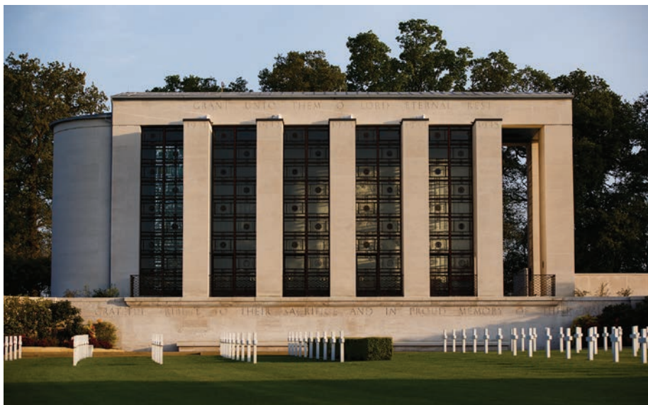
The north face of the memorial building.