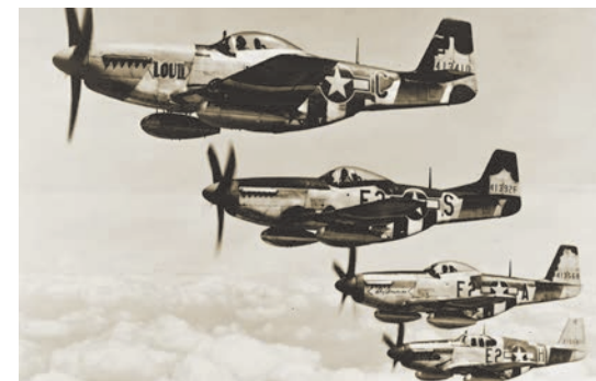
North American P-51 Mustangs of the 361st Fighter Group fly in formation over England in 1944.

When the Strategic Bombing Campaign ended on April 12, 1945, the Americans had dropped 1,388,000 tons of bombs and the British 988,000 on Germany – at the cost of 110,000 airmen from both nations lost in action.