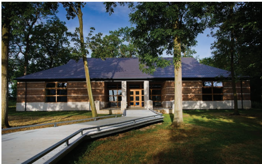
The visitor center is located convenient to the cemetery entrance.