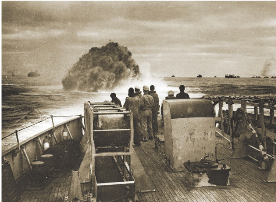
Coast Guardsmen of the U.S. Coast Guard Cutter Spencer watch the explosion of a depth charge blasting German submarine U 175 about to attack a convoy in the North Atlantic. April 17, 1943.

Through 1942 the balance poised precariously, with the Allies losing 800,000 tons