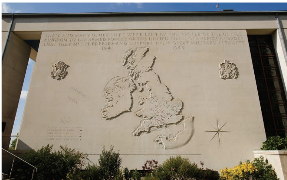
The map displays locations of American units in the United Kingdom during World War II.