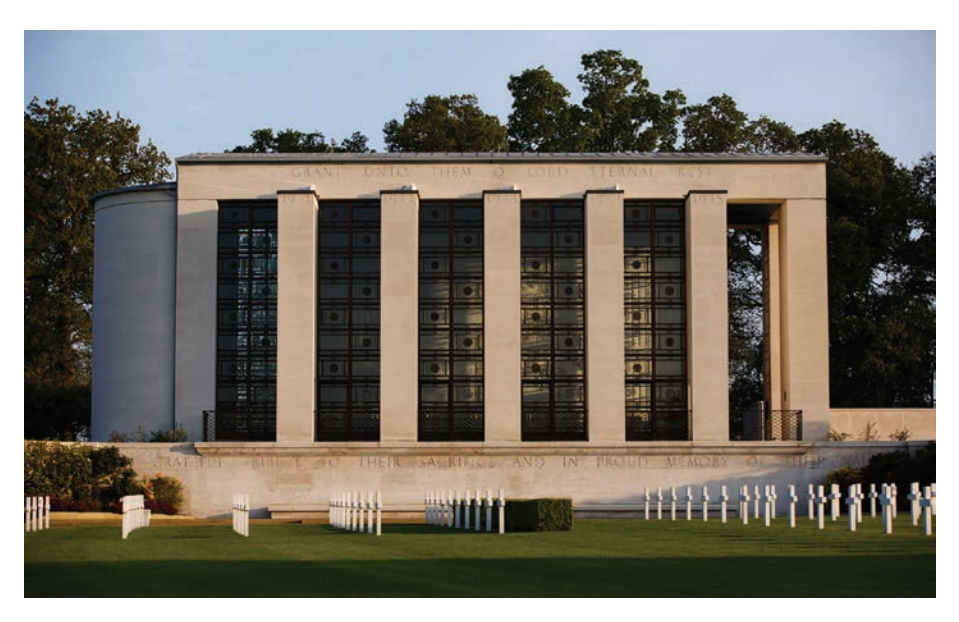
The north face of the memorial building.