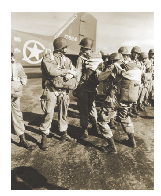
U.S. Army paratroopers of the 2nd Battalion, 503rd Parachute Infantry, inspect equipment before a training jump in England, 1942.

was significant at first, but force and diplomacy induced the Vichy French to surrender. In Algiers, a pro-Allied uprising enabled the landing force to take the city with minimal conflict.