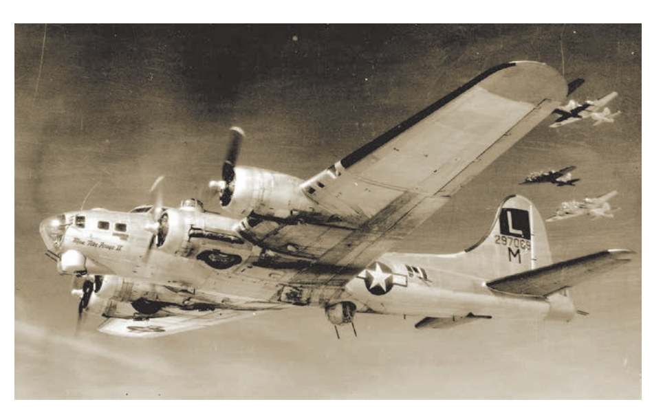
The B-17G Flying Fortress "Mon Tete Rouge II," and other bombers of the 452nd Bomb Group, flying on a mission to bomb German targets in France on March 28, 1944.