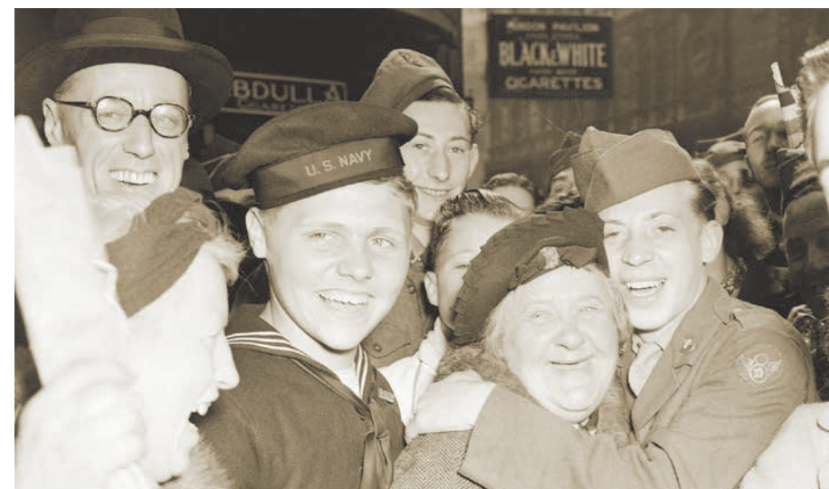
American servicemen and British civilians in London celebrate Germany's surrender. May 8, 1945.