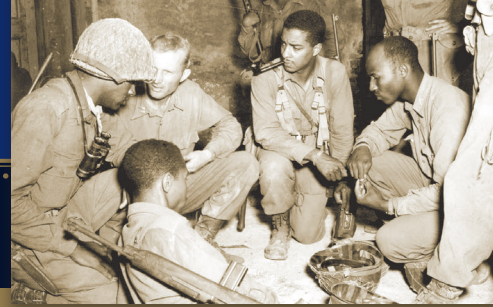
Officers of the 92nd Infantry Division plan crossing of the Arno River, Sep. 1, 1944.