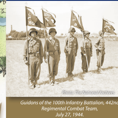
Guidons of the 100th Infantry Battalion, 442nd Regimental Combat Team, July 27, 1944.

Here you can meet our staff, get your questions answered, and sign the guest register.