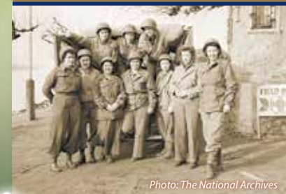
The first Army nurses to cross the Rhine with the 51st Field Hospital.

A boy or young man holding a sword and laurel wreath reminds us that those buried here died in the prime of their lives. They embody the meaning of sacrifice.