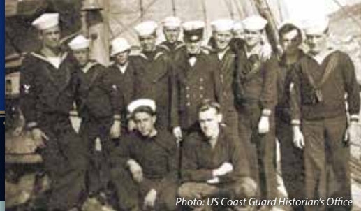
Crewmembers of the USCGC Tampa served on convoy escort duty in the Atlantic in 1918.