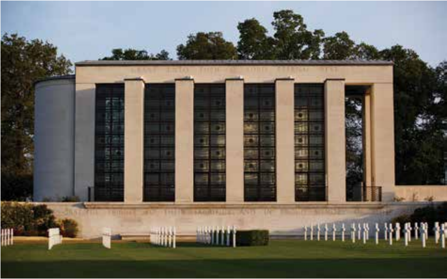
The north face of the memorial building.