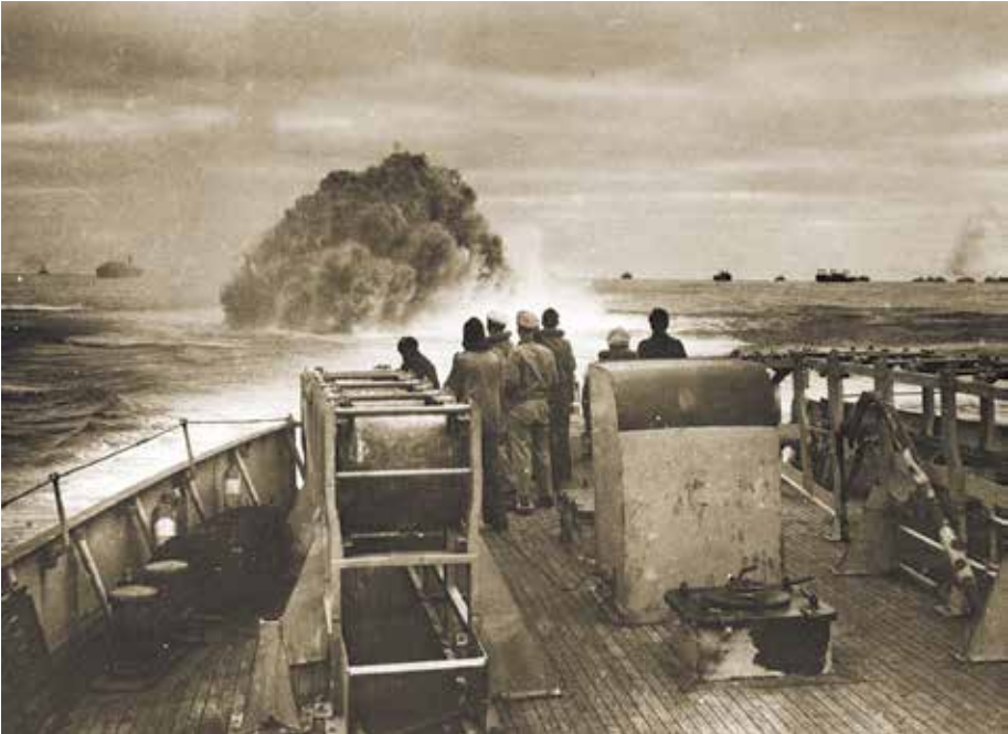
Coast Guardsmen of the U.S. Coast Guard Cutter Spencer watch the explosion of a depth charge blasting German submarine U 175 about to attack a convoy in the North Atlantic. April 17, 1943.

Through 1942 the balance poised precariously, with the Allies losing 800,000 tons