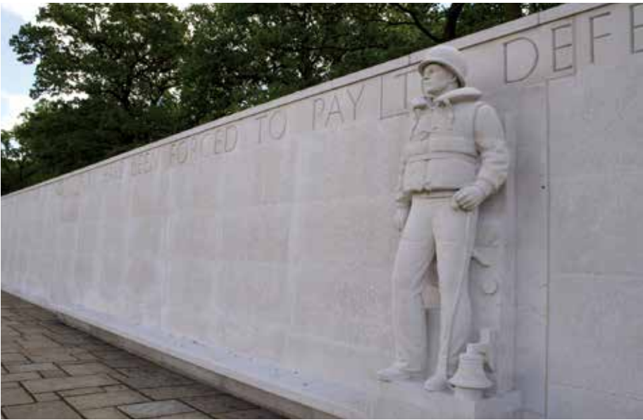
The statue of a Coast Guardsman is one of four standing watch over the Wall of the Missing.