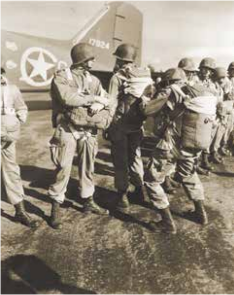
U.S. Army paratroopers of the 2nd Battalion, 503rd Parachute Infantry, inspect equipment before a training jump in England, 1942.

was significant at first, but force and diplomacy induced the Vichy French to surrender. In Algiers, a pro-Allied uprising enabled the landing force to take the city with minimal conflict.