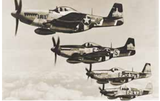
North American P-51 Mustangs of the 361st Fighter Group fly in formation over England in 1944.

American forces that had been building in England since mid-to-late 1942 were committed into Operation TORCH. American task forces landed on beaches flanking Casablanca, Morocco. Combined Anglo-American task forces similarly attacked Oran and Algiers, Algeria. Near Casablanca and Oran, resistance