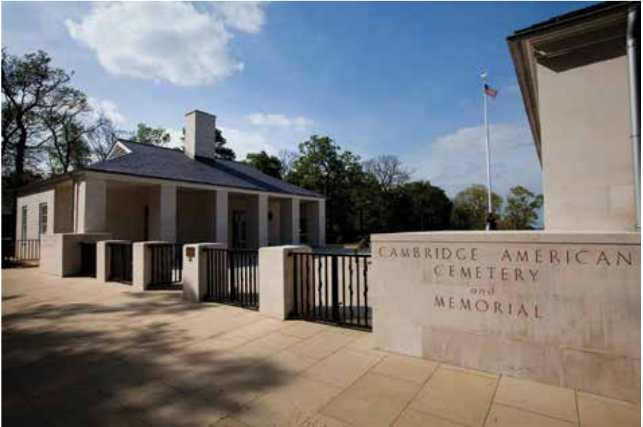
The entrance welcomes visitors to Cambridge American Cemetery.

The cemetery is situated on the north slope of a hill from which Ely Cathedral, 14 miles in the distance, can be seen on a clear day. It is framed by woodland on the west and south. The road to Madingley runs along the cemetery's northern border.