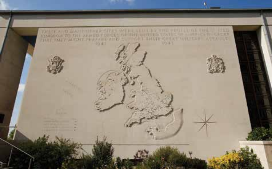
The map displays locations of American units in the United Kingdom during World War II.