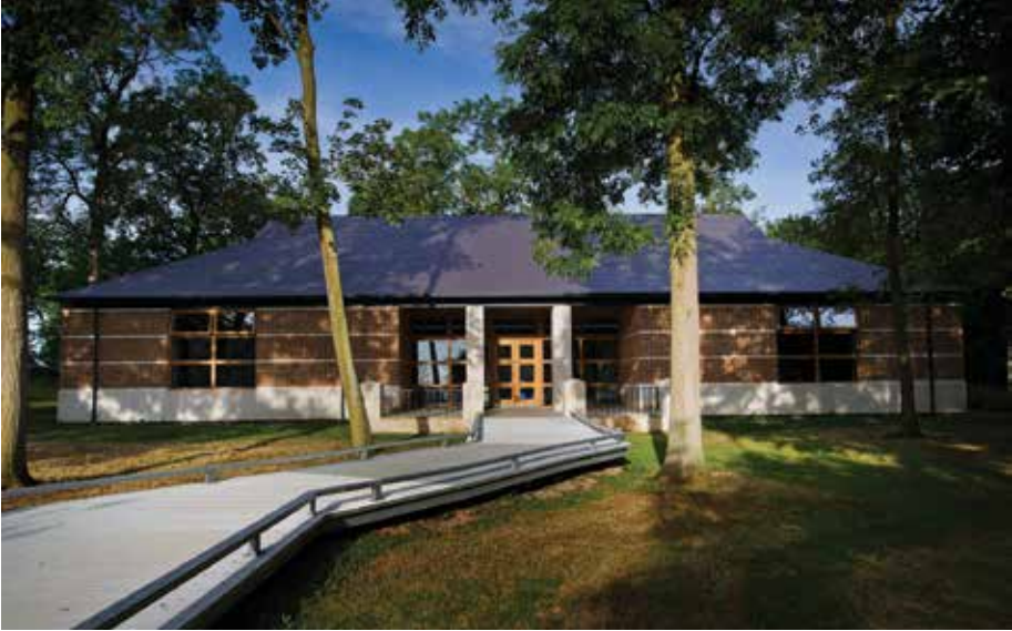
The visitor center is located convenient to the cemetery entrance.