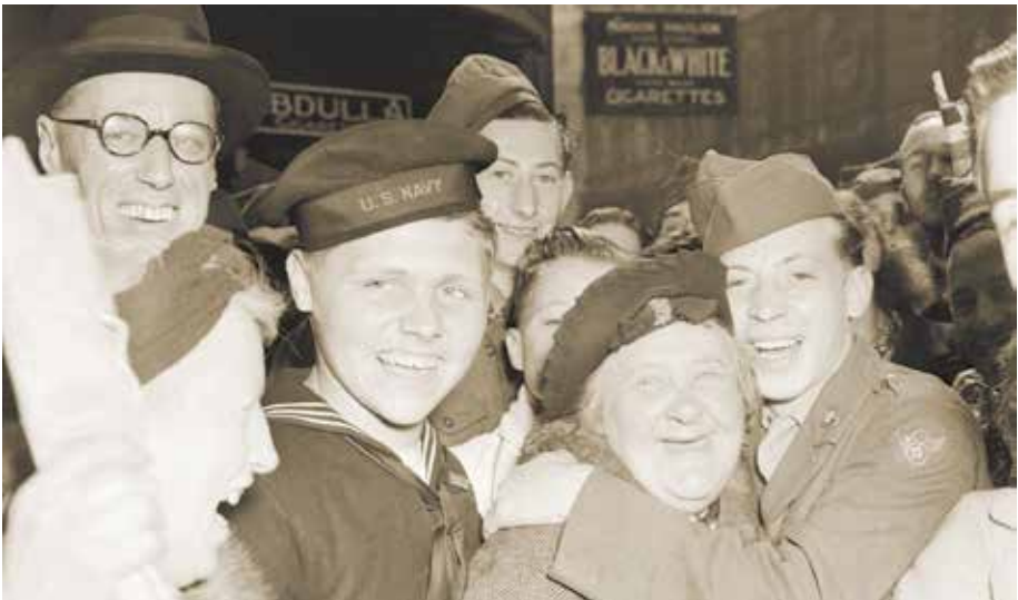
American servicemen and British civilians in London celebrate Germany's surrender. May 8, 1945.