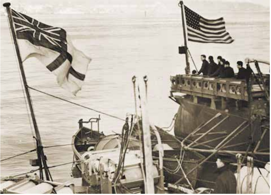
British and American warships lie alongside each other at the U.S. naval base in Londonderry, Ulster. The American warships had escorted a convoy across the Atlantic, and arrived at Londonderry in January 1942.

of shipping more than they replaced with new construction that year. In May 1943 the balance finally tipped decisively in favor of the Allies. In that month, increasingly effective Allied forces sank 41 of 240 German U-Boats, while losing fewer than 300,000 tons of shipping to them.