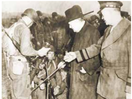
Prime Minister Winston Churchill and General Dwight D. Eisenhower inspect a mortar crew during a tour of an American Army base in England before D-Day, 1944.