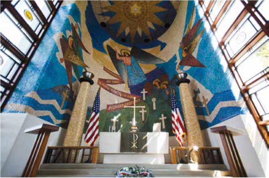
The deep blue of the ceiling above the altar denotes the depth of infinity.