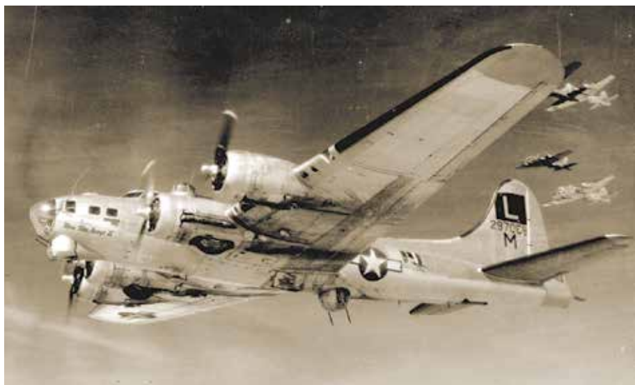
The B-17G Flying Fortress “Mon Tete Rouge II,” and other bombers of the 452nd Bomb Group, flying on a mission to bomb German targets in France on March 28, 1944.

Deep American daylight raids, such as one on Schweinfurt on October 14, 1943, proved prohibitively costly until the Americans perfected a long-range fighter to escort their bombers to distant targets. This capability was achieved in December 1943 with the P-51 Mustang, upgraded for a considerably greater range. Lieutenant Colonel Thomas Hitchcock, Jr. of the U.S. Army Air Forces participated as a pilot in the improvement