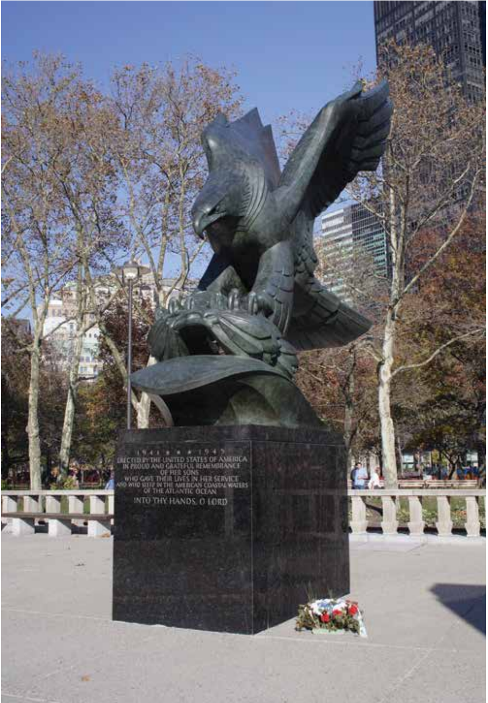
The eagle atop the base points southwest to the Statue of Liberty.