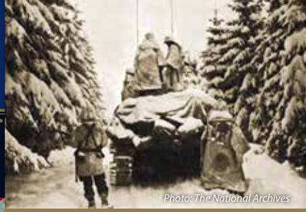
82nd Airborne Division soldiers advance in "Battle of the Bulge"