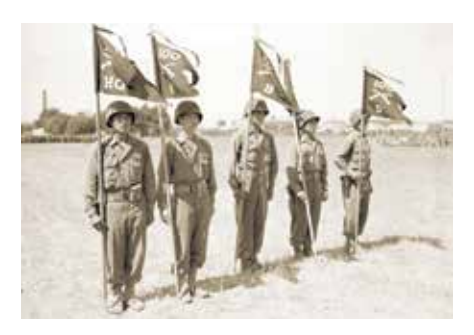
Guidon bearers of the 100th Battalion, 442nd Regimental Combat Team. The Japanese American unit was among those reaching the Arno River area on July 23, 1944.

The Allies broke through the Gustav Line on May 13. They pushed on to link up with the Anzio beachhead and overrun subsequent German defensive lines. On June 4, 1944 American units entered Rome and liberated the first European capital city of the war.