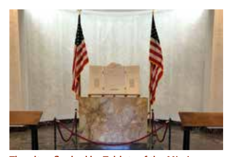
The altar, flanked by Tablets of the Missing.