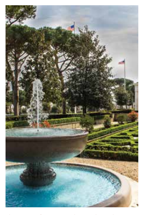
The granite fountain in the North Garden