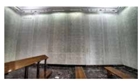
Brigadier General Charles L. Keerans, Jr. is the highest –ranking among the 3,095 individuals whose names and information are inscribed here.