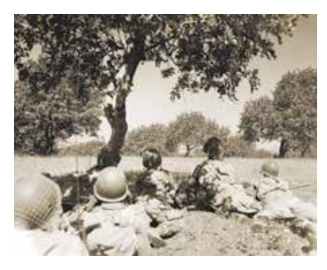
82nd Airborne Division paratroopers at Biazza Ridge, Sicily, the second day after their night jump on July 9, 1943.

A preliminary air campaign secured air superiority for the Allies. On July 10, 1943 the U.S. Navy landed the Seventh Army with three reinforced divisions around Gela on Sicily's southern coast. The night before, Army Air Forces troop carrier wings dropped paratroopers of the 82nd Airborne to seize advanced positions and