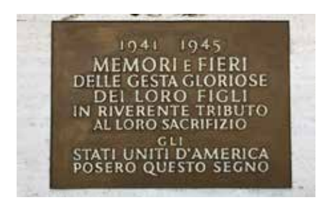
"The Dedication Tablet"