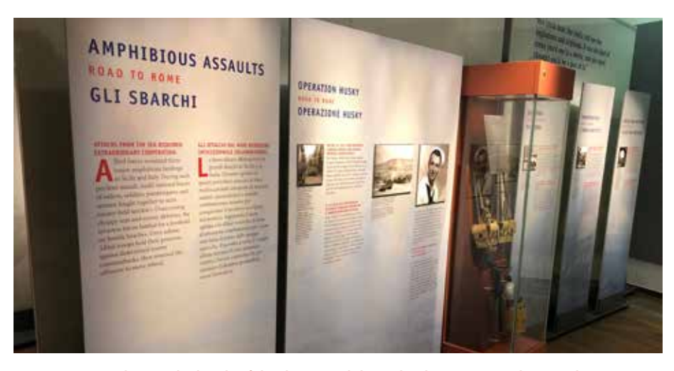
Descriptive panels provide details of the three amphibious landings.

Restrooms are conveniently located near the cemetery entrance.