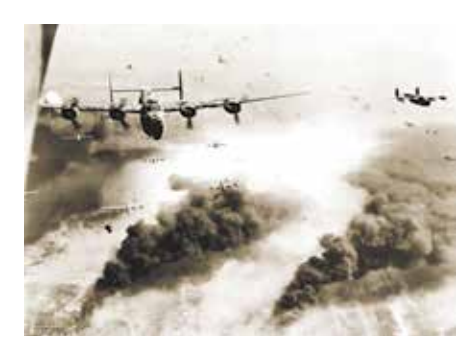
Fifteenth Air Force B-24 Liberator bombers fly over the Concordia Vega Oil refinery in Ploesti, Romania, after dropping their bomb loads on the oil cracking plant. May 31, 1944.

After the capture and subsequent repair of destroyed facilities, the Fifteenth Air Force based its groups in the area. The Foggia complex supported heavy bomber