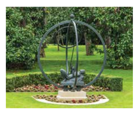
A statue of Orpheus rests on the armillary sphere in the South Garden.

North of the memorial adjacent to the map room, is a more formal garden planted in parterre arrangements with beds of a variety of seasonal flowers and shrubs.