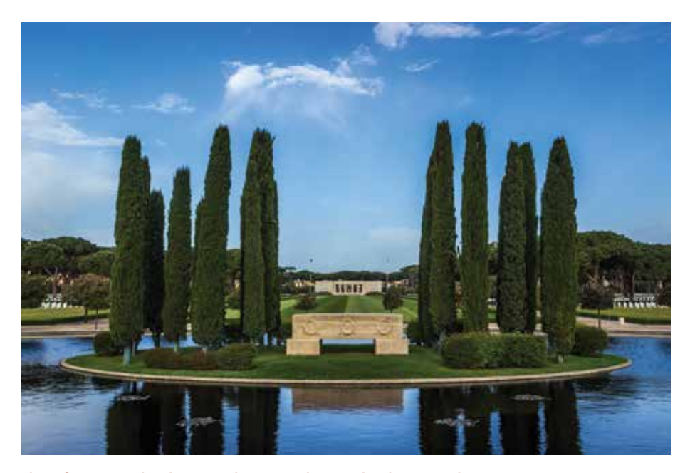
The reflecting pool with cenotaph.

The cemetery sits in the zone of advance of the U.S. 3rd Infantry Division during the Anzio-Nettuno campaign beginning in January 1944. A temporary wartime cemetery was established here on January 24, 1944, two days after the units of the VI Corps landed on the beaches nearby.