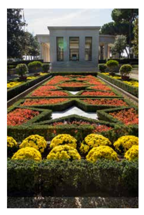
The North Garden.

At the far end of the garden is a Baveno granite fountain consisting of a large-semi-circular bowl on a wide pedestal. It was carved from a single piece of granite quarried near the north end of Lake Maggiore. Cascades of water flow from the bowl into a low basin.