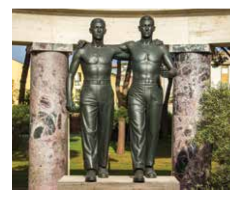
The "Brothers in Arms" sculpture is the central feature of the peristyle.

"The "Brothers In Arms" sculpture represents an American soldier arm in arm with an American sailor. The statue symbolizes the fraternity between the U.S. Army and Navy that was essential to the success of the three amphibious assaults in Italy during World War II. The two servicemembers can be distinguished via small differences in their identification tags, belt buckles, and trouser pockets. The bronze sculpture is by Paul Manship of New York. It was cast at the Battaglia Foundry in Milan.