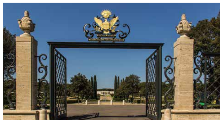
The U.S. seal surmounts the cemetery's entry gates. Immediately inside to the right is the Visitor Center.

THEY DIED THERE VALIANTLY AND HEROICALLY, GIVING THEIR LIVES THAT PEOPLES OF EUROPE MIGHT BE LIBERATED FROM TYRANNY. ... THEY REST TRANQUIL AND SECURE IN THE FRIENDLY SOIL OF ITALY. MAY OUR GREAT DEBT TO THEM, AND ALL OTHERS WHO DIED IN THE CAUSE OF FREEDOM, SERVE AS AN INSPIRATION TO ALL PEOPLES TO DEDICATE THEMSELVES TO FREEDOM AND LASTING PEACE.