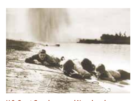
U.S. Coast Guardsmen and Navy beach battalion men hug the shaking beach south of Salerno as a Nazi bomber unloads on them. September 1943.

The Germans and Italians decided to withdraw from Sicily. Fighting a skillful delaying action, they evacuated 100,000 troops from the island during August 3-16. These included three German mechanized divisions, their best and most mobile forces. Less mobile infantry and coastal defense units generally surrendered. The American 3rd Infantry Division entered Messina on the night of August 16.