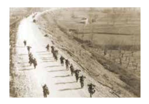
Two columns of U.S. soldiers march northward along Italy's highway 6—the famous "Road to Rome"—at a position south of Cassino, January 31, 1944.