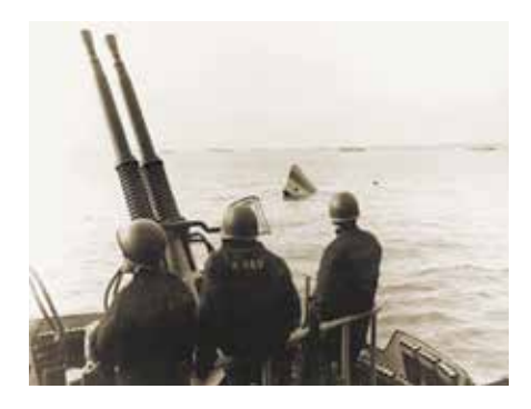
Sailors at a 40 mm antiaircraft gun mount aboard USS Brooklyn (CL-40) observe USS Portent (AM-106) sinking off Anzio after hitting a mine on D-Day, January 22, 1944.

As the Naples-Foggia Campaign ground to a halt, the Allies faced the formidable defenses of the Gustav Line. They resolved to outflank this line with an amphibious landing. American and British forces landed ashore near Anzio and Nettuno on January 22, 1944. The landings were virtually unopposed at first, and reinforcements were landed.