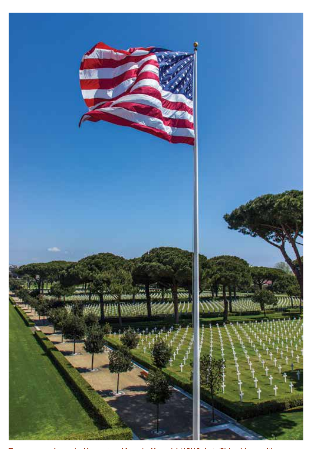
The graves area is seen looking eastward from the Memorial.