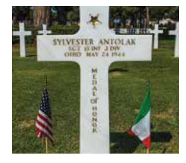
Sylvester Antolak's headstone.