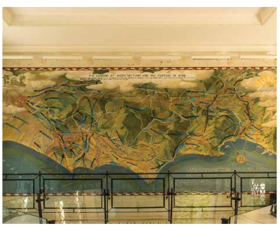
The map on the east wall is named "The Landing at Anzio/Nettuno and the Capture of Rome."

On the east wall is one large map, "The Landing at Anzio/Nettuno and the Capture of Rome." This map portrays the landings in the vicinity of Anzio, the establishment of the Anzio beachhead, the subsequent fighting therein, the final breach of the Gustav Line on May 11, 1944 by American and Allied forces, the swift Allied advance north, the link up with troops breaking out of the Anzio beachhead, and the liberation of Rome on June 4, 1944.