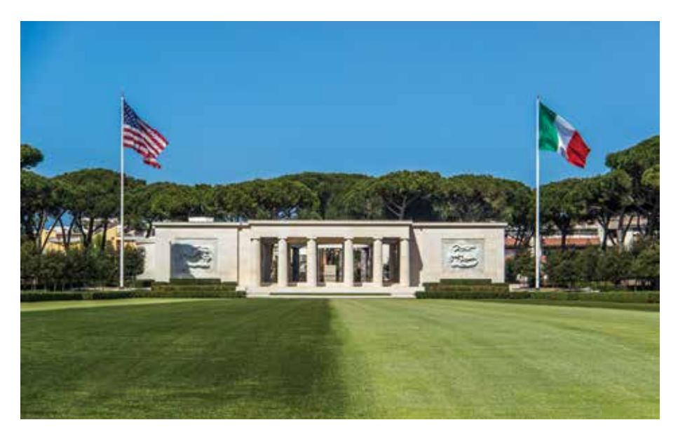
The memorial viewed from the east.